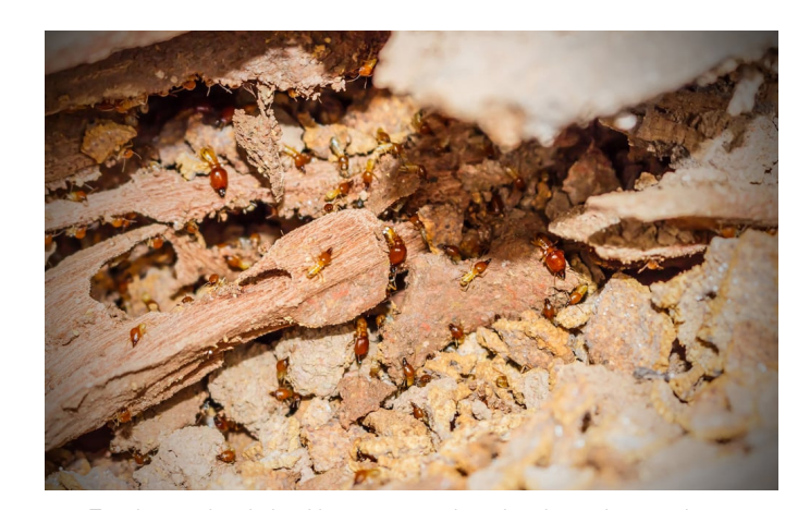
Termites work quietly without you even knowing destroying your home