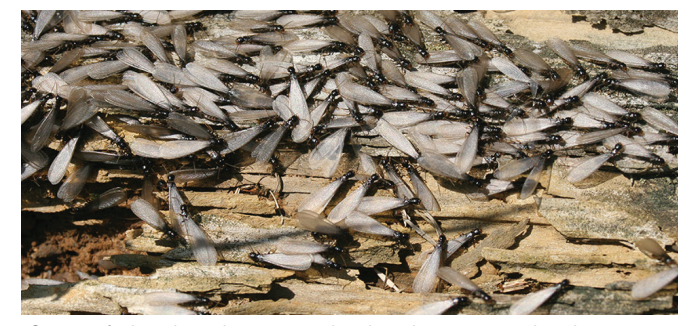
Swarm of winged termites, a sure sign there is a mature colony in your area.