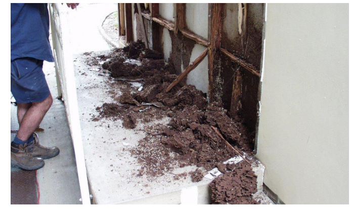
Termite damage can cause a financial burden