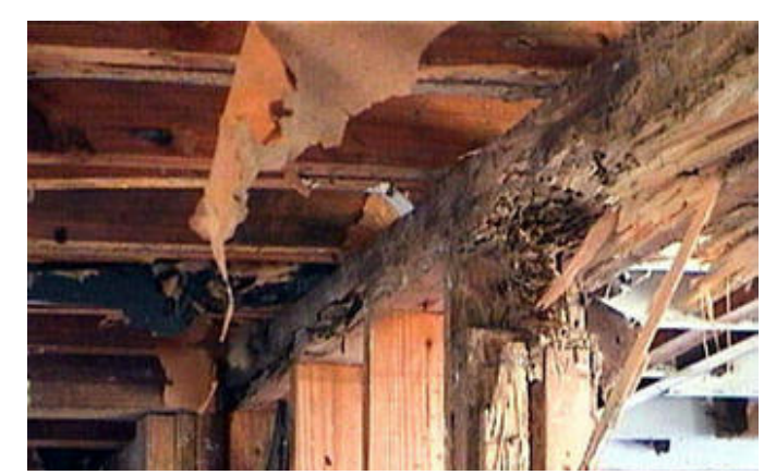
A yearly termite inspection by an accredited Fipforce HP technician can save your home