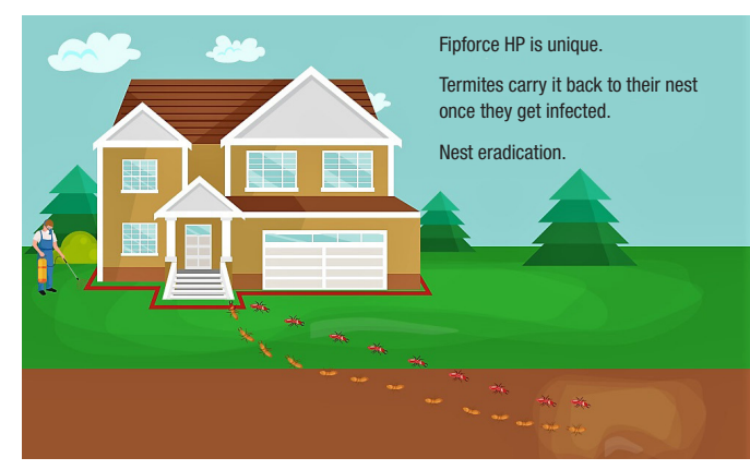
Fipforce HP is unknowingly carried back to the nest causing total elimination