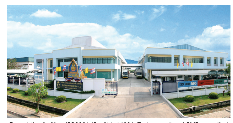
Formulation facility - ISO9001 (Quality), 14001 (Environment) and GMP accredited.