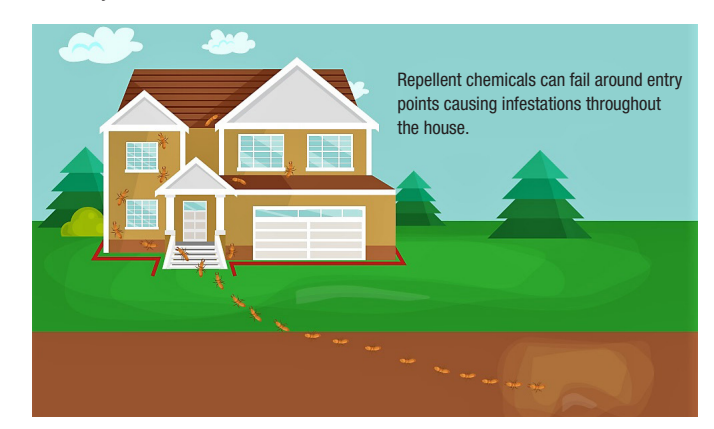
If your home is not protected by Fipforce HP you run a risk of termite destruction

While older products available in the market are typically repellent to termites and other insects, Fipforce HP Aqua containing fipronil is a totally unique molecule in that its mode of action is non-repellent to termites at low doses. This unique non-repellent attribute is what makes Fipforce HP so effective in its ability to create a lethal Stealth Termite Protection Zone around your home.